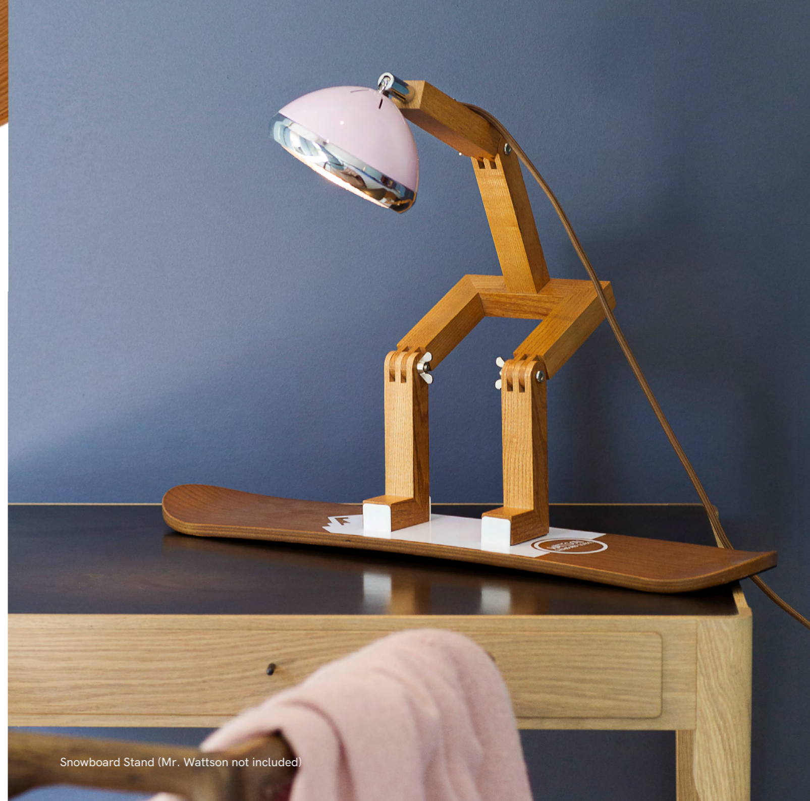
Snowboard Stand (Mr. Wattson not included)