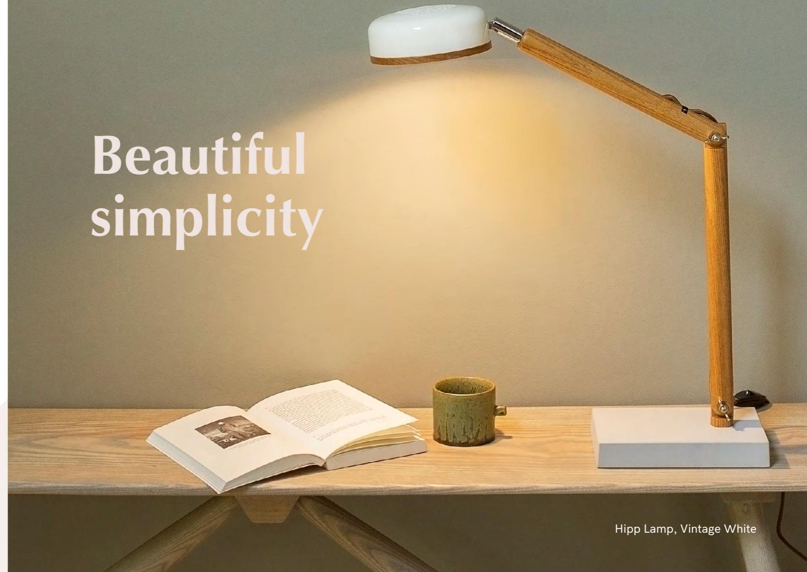
Hipp Lamp, Vintage White