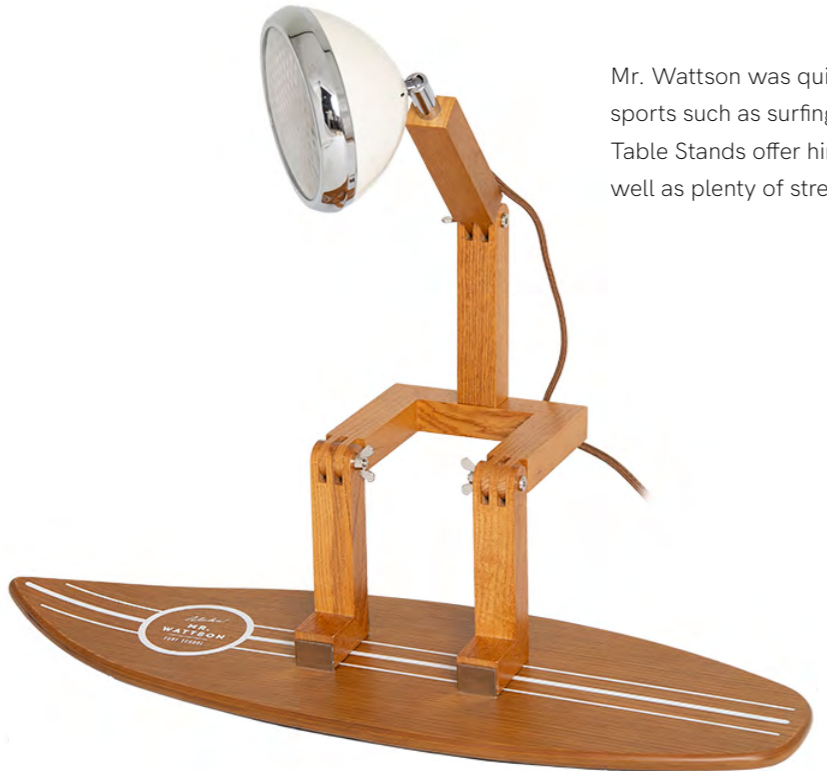
Surfboard Stand (Mr. Wattson not included)

Mr. Wattson was quick to take to adventure sports such as surfing and snowboarding. Both Table Stands offer him new ways to shine... as well as plenty of street cred.