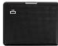
LOZENGE BLACK NEW