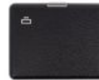
SNAKE BLACK NEW