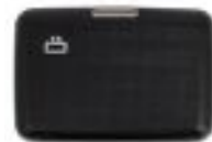
LOZENGE BLACK NEW