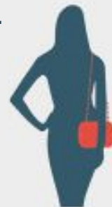
On the shoulder