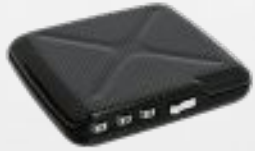
GENUINE CARBON FIBER

DECK DISPLAY Capacity : 7 Code Wallet inside their packaging.