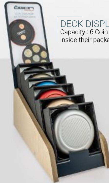
DECK DISPLAY Capacity : 6 Coin Dispenser inside their packaging.

Compact and convenient, the Coin Dispenser is a unique way to carry your change. It makes handling coins easy, comfortable, and fun! You will never deal with loose change in your pocket or purse again.