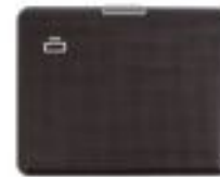
LOZENGE BROWN NEW