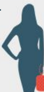
With the purse strap