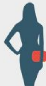
On its own