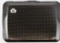
GENUINE CARBON FIBER