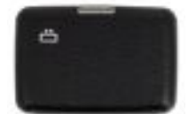
SNAKE BLACK NEW