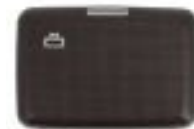
LOZENGE BROWN NEW